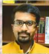
Tushar Agarwal Advocate of Supreme Court of India